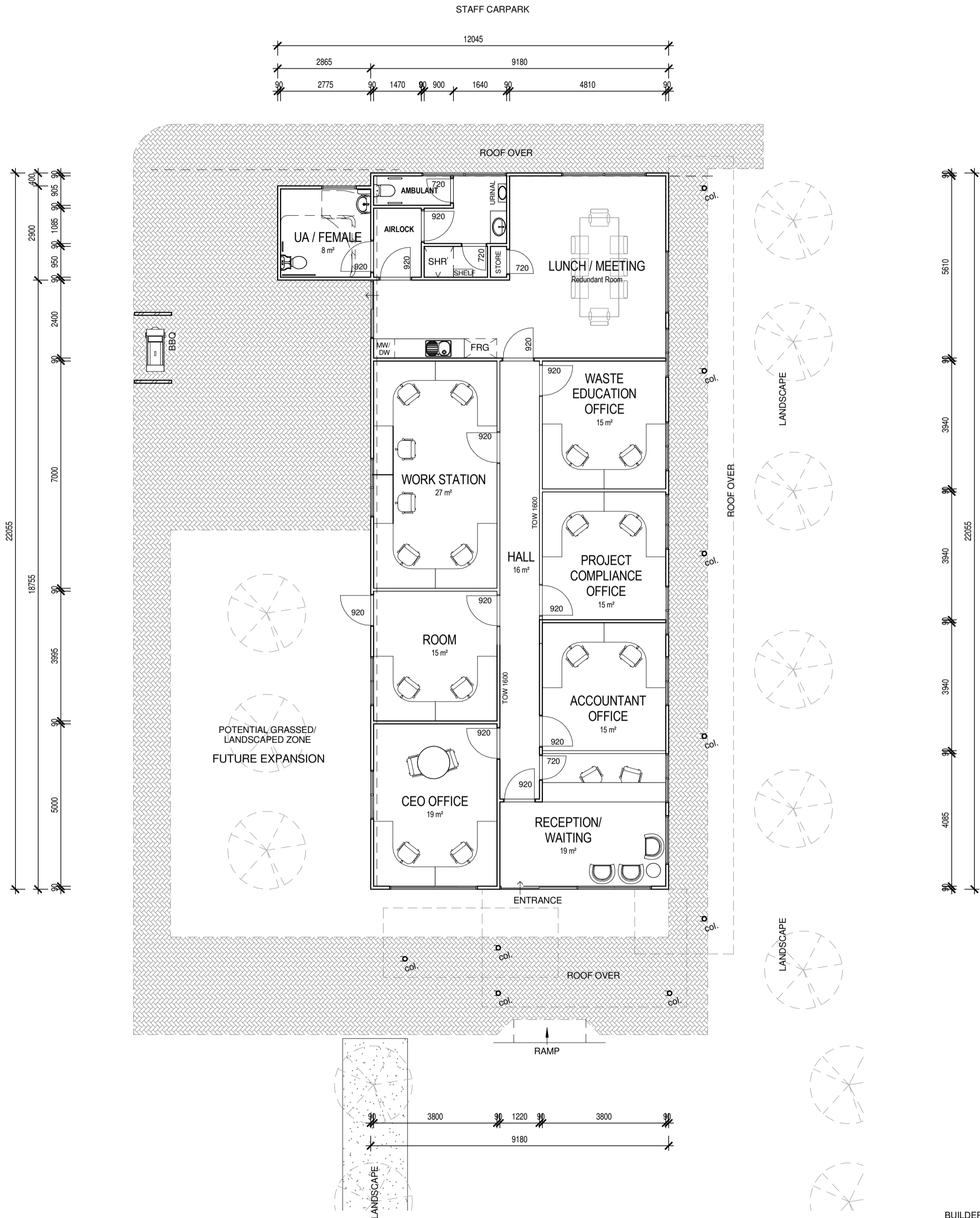
1 01 - PLAN - WASTE OPERATIONS OFFICE 1 : 100